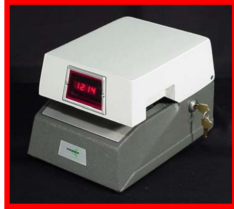
Model 776 available without Digital Display.

Dual Printing Heads Precise Timing Accurate Numbering Heavy Penetration Lasting Performance